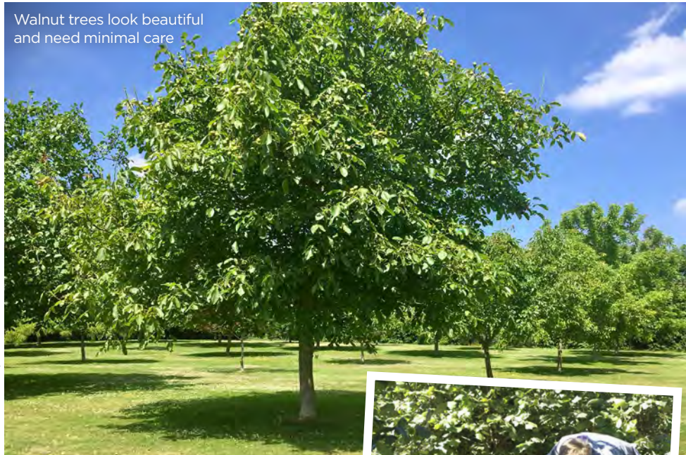
Walnut trees look beautiful and need minimal care