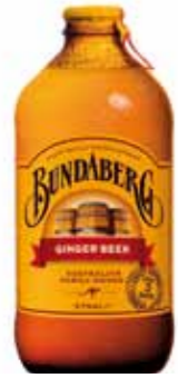
Bundaberg Ginger Beer , £4.49 for 4 x 375ml bottles, Tesco: 0800-323 4040, www.tesco.com