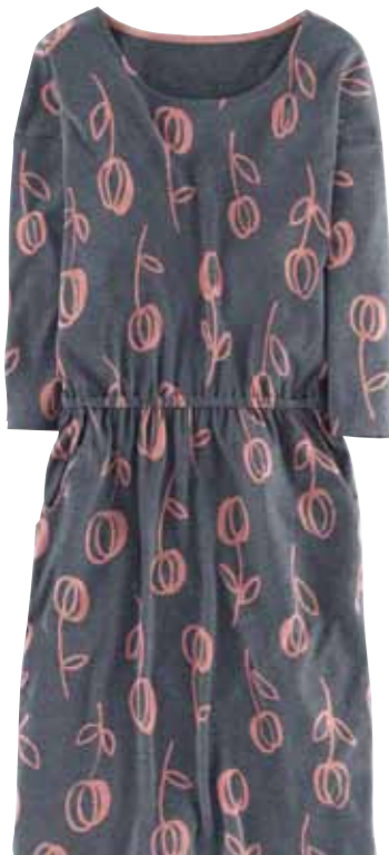
Hettie dress, Grey Marl Tulips , £69, Boden: 0330-333 0000, www.boden.co.uk