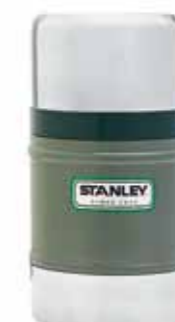
Stanley Classic Aladdin Food Flask , £31.70, Tesco: as before