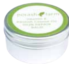
Vitamin E Kentish Cobnut Oil Skin Repair Balm (50ml) , £16, Potash Farm: 01732-882734, www.kentishcobnuts.com