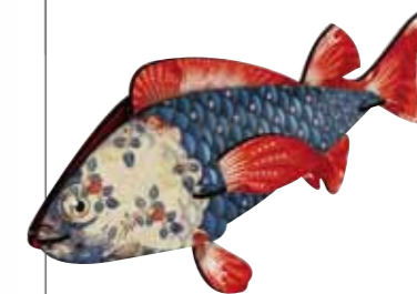
Miho Heartbreaker fish decoration , £13.99, Cotswold Trading: 01386-853331, www.cotswoldtrading.com