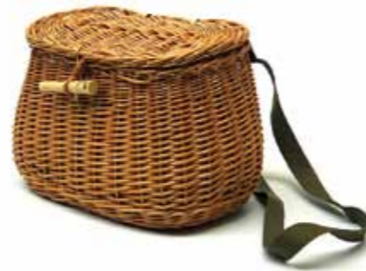
Wicker fishing creel , £25, Prestige Wicker: 0121-557 9842, www.prestigewicker.co.uk