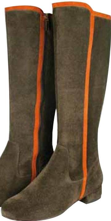
Chocolate contrast suede boots , £99 (was £199), Cordings: 020-7758 4122, www.cordings.co.uk