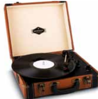
Auna Jerry Lee Retro Record Player Turntable , £52.90, HiFi Tower: 020-3318 4283, www.hifi-tower.co.uk