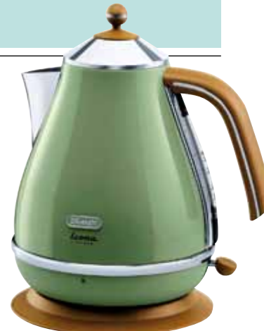
Icona Vintage Jug Kettle , £59.99, DeLonghi at Currys: 0344-561 0000, www.currys.co.uk