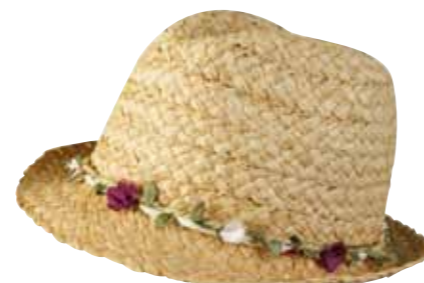
Flower trilby , £25, Fat Face: 02392-441234, www.fatface.com