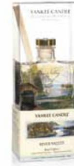
Reed Diffusers , £13.45, Yankee Candle River Valley Signature Range at House of Fraser: 0345-602 1073, www.houseoffraser.co.uk