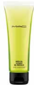
Mac Green Gel Cleanser , £16, Selfridges: 0800-123400, www.selfridges.com