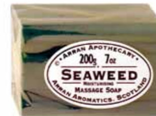
Seaweed Moisturising Massage Soap , £2.25, Arran Aromatics: 01563-851826, www.arranaromatics.com