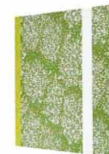
Large Green Blossom silk screen photo album , £49.95, Liberty: as before