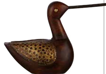
Antique duck ornament , £15, John Lewis: as before