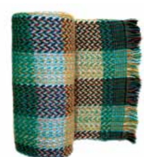
Celtic/Tibet picnic rug , £25, National Trust shop: 0300-123 2025, shop.nationaltrust.org.uk