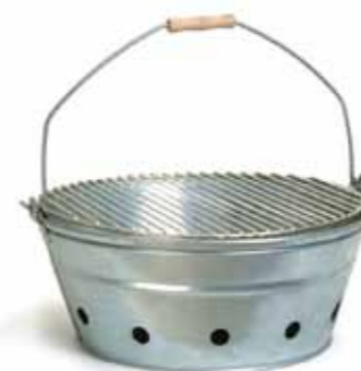
Large portable barbecue , £44, Not On The High Street: as before