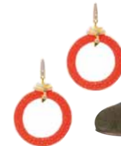
Stingray hoop gold orange earrings , £245, by Latelita London at House of Fraser: as before