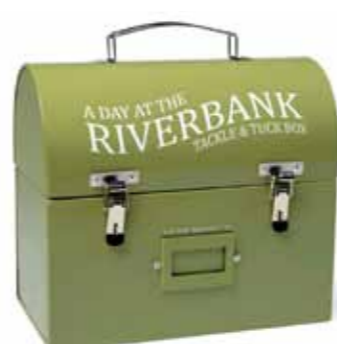
A Day At The Riverbank Tackle & Tuck Box , £20, by Aspen & Brown at John Lewis: as before