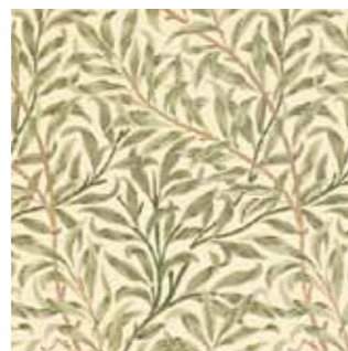
Willow Boughs wallpaper , £58 per roll, by William Morris at Wallpaper Direct: 01323-430886, www.wallpaperdirect.com