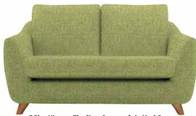
G Plan Vintage The Sixty Seven sofa in Marl Green , £1,250, John Lewis: 0345-604 9049, www.johnlewis.com