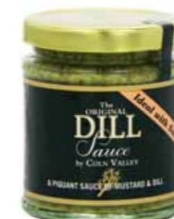
The Original Dill Sauce , £17.50 for 8 x 175g jars, Coln Valley Smokery: 01285-740311, www.colnvalley.co.uk